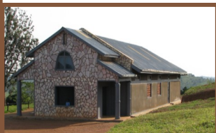
Kisojo Independent Baptist Church