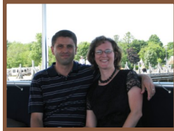
14 th Anniversary get-away

Greetings to you in the name of our Lord and Savior Jesus Christ. I wrote in our last letter that we would be taking a three month furlough beginning in June. We spent a good part of May preparing our home for the duration of the time that we would be away. I was also able to finish the term that I was teaching in Bible College. Ten students finished a class on the book of Hebrews and did very well.