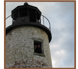
See us in the lighthouse?

In May, we also made final preparations for the church in Kisojo to operate while we are away. We had planned to have a van route continue to pick up people in our absence as there are about three people who need special assistance to come to church. But, in May we had too many vehicle break downs and mishaps for us to be able to leave one in place. The ministry is growing too large for us to continue to help people like we have in the past and we have been forced to cut back as a result. Because of the timing and the occurrences which were beyond our control, we feel as though the Lord has made it very clear that the people themselves must step up and take more responsibility. The three months that we are away seem to be a test from the Lord that will determine their willingness to do so. Please earnestly pray for God's hand to help and guide them and the leaders that have been developed.