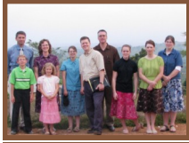
Canada group with us