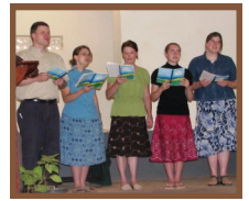
Canada group singing

The group had a teen meeting at Masaka Independent Baptist Church. They did a tremendous job with all the activities. Seventeen teens from our church took part in the events which included games, singing and preaching. I know that our youth were challenged and changed in the midst of enjoying themselves.