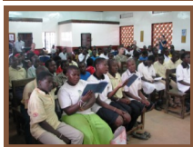
Some of our teens